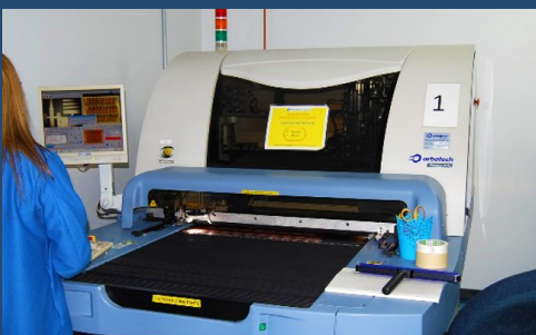
Test and Inspection