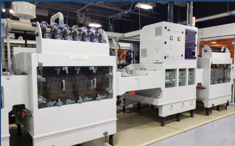
Full Complement of Plating, Etching, and Imaging