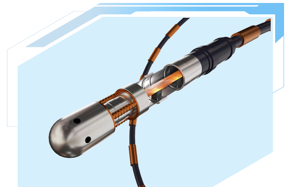
Tissue Ablation Catheter

When it comes to industrial, medical, aerospace, military, and defense markets, precision assembly is crucial. Fralock is your trusted partner, offering advanced capabilities to produce assemblies that satisfy your unique requirements. Our commitment to quality, automation, and customer satisfaction is what sets us apart.