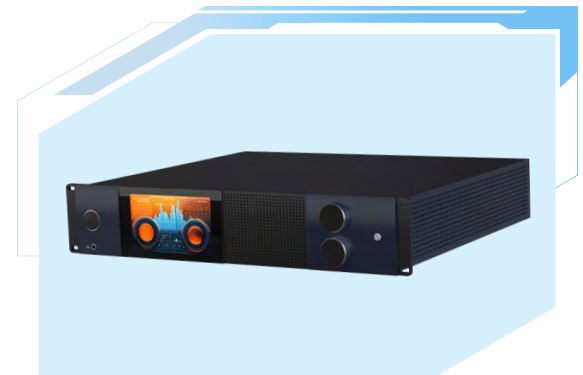
Multi-Channel Audio Interface